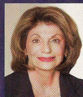
SHELLEY BERKLEY DEMOCRAT