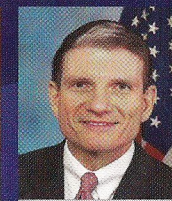
JOE HECK REPUBLICAN