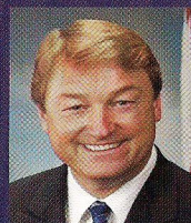
DEAN HELLER REPUBLICAN