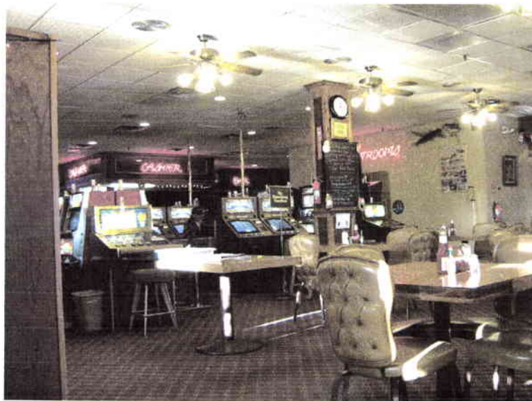
Searchlight Nevada Nugget Casino / Restaurant

The Searchlight Nugget Casino and Restaurant was built and opened in 1979. The main floor consists of a 3,260 square foot casino floor and 5,784 square feet for the bar, restaurant, kitchen offices and storage. The basement of the building is 8,140 square feet and is built out with meeting space, banquet rooms, and storage. Above the Casino is a 1,715 square foot apartment. Total floor space in the building is 18,849 square feet.